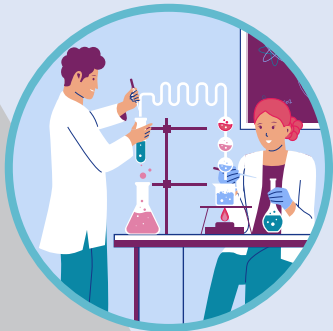
SUMMER FELLOWSHIP 8 WEEKS