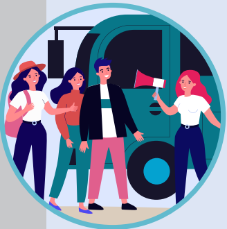
EXPERIENCE WEEKS 1 WEEK