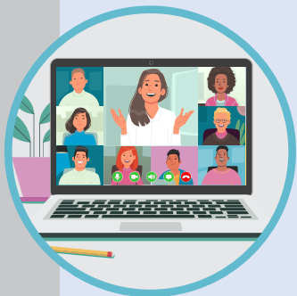
LEARNING COMMUNITY 1 HOUR

Immersive, hands-on learning empowers teachers to make transformative classroom changes.